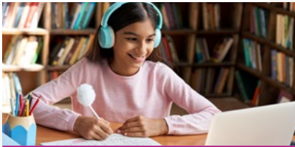
Award-winning endpoint security