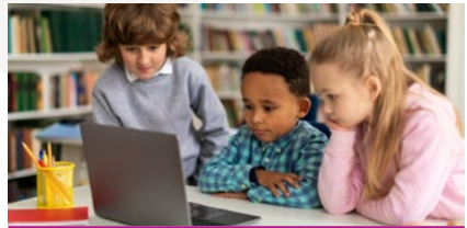
Unified endpoint management