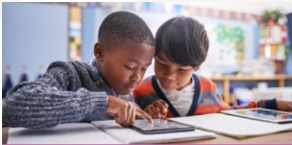
Advanced mobile protection